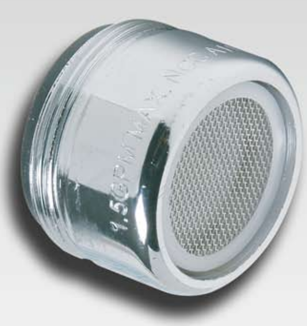
Item Number N3104-1.5